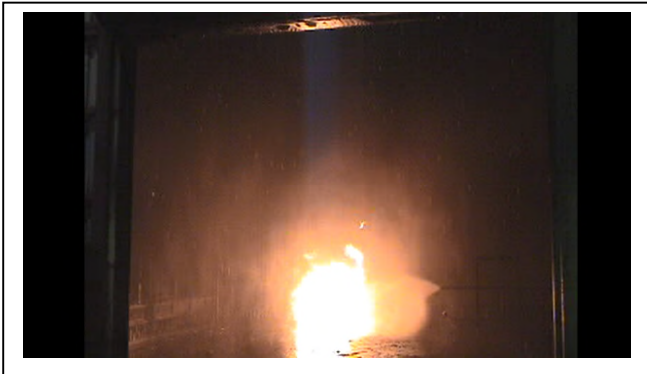
Time = 8 seconds