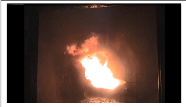
Time = 4 seconds