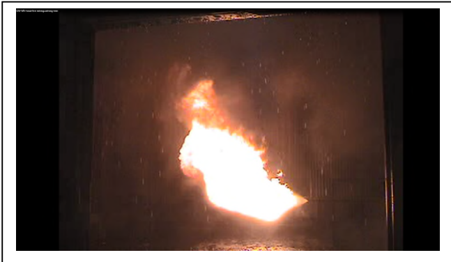
Extinguishing start – Time = 0 seconds

GW M5 / 6 MW Fire / 0,4 Mpa / 4 m height / 3 x 3 m spacing