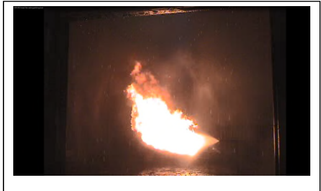
Time = 2 seconds