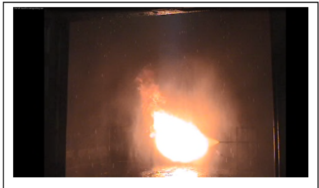
Time = 6 seconds