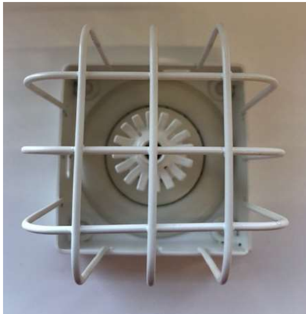
GW-S SSP sprinkler with Ø75mm 2-piece rosette fully protected with GW Guard – Retrofit.