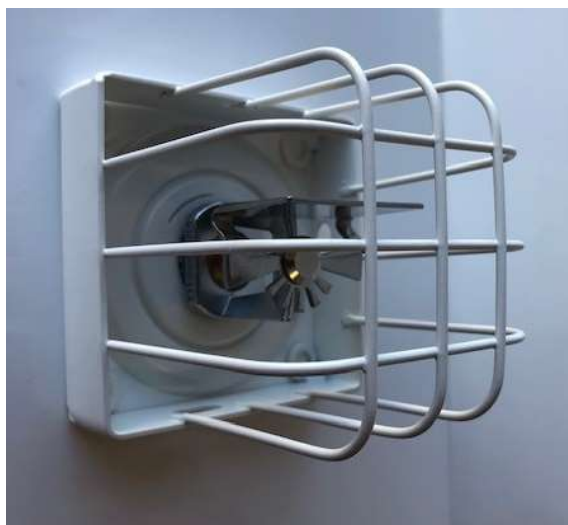
GW WHEC (horizontal sidewall) sprinkler with Ø75mm 2-piece rosette.

GW SPRINKLER A/S Kastanievej 15, DK-5620 Glamsbjerg, Denmark Tel: +45 64 72 20 55 Fax: +45 64 72 22 55 E-mail: sales.dep@gwsprinkler.com